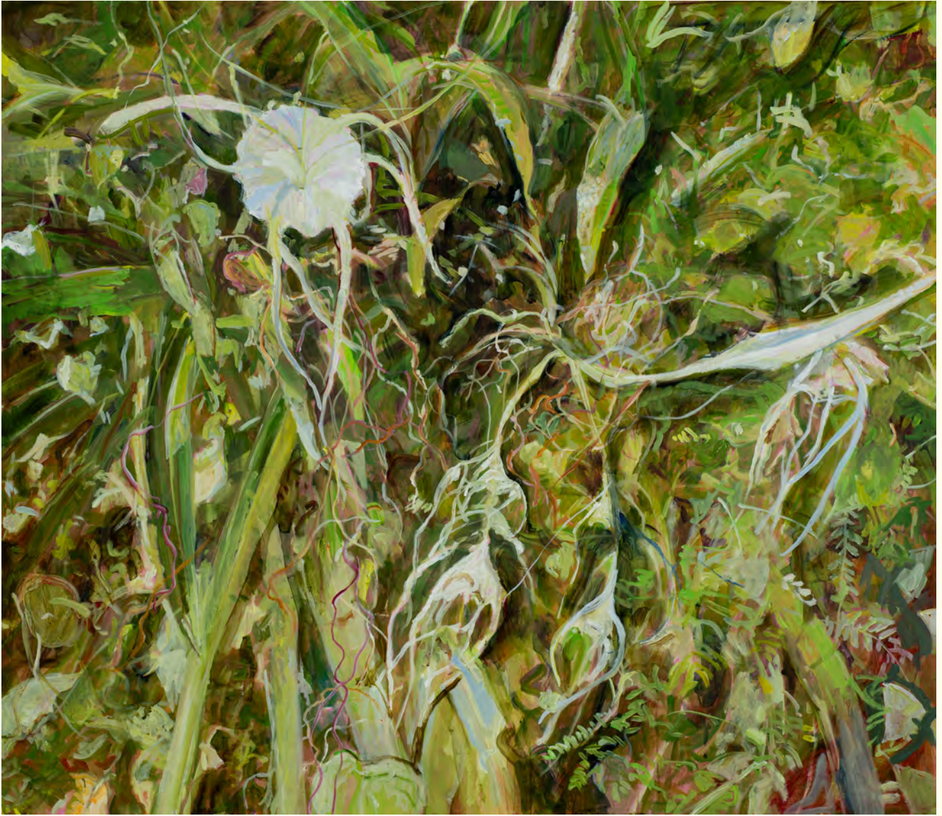
And? Liz Sullivan 700 x 800mm oil on board 2024