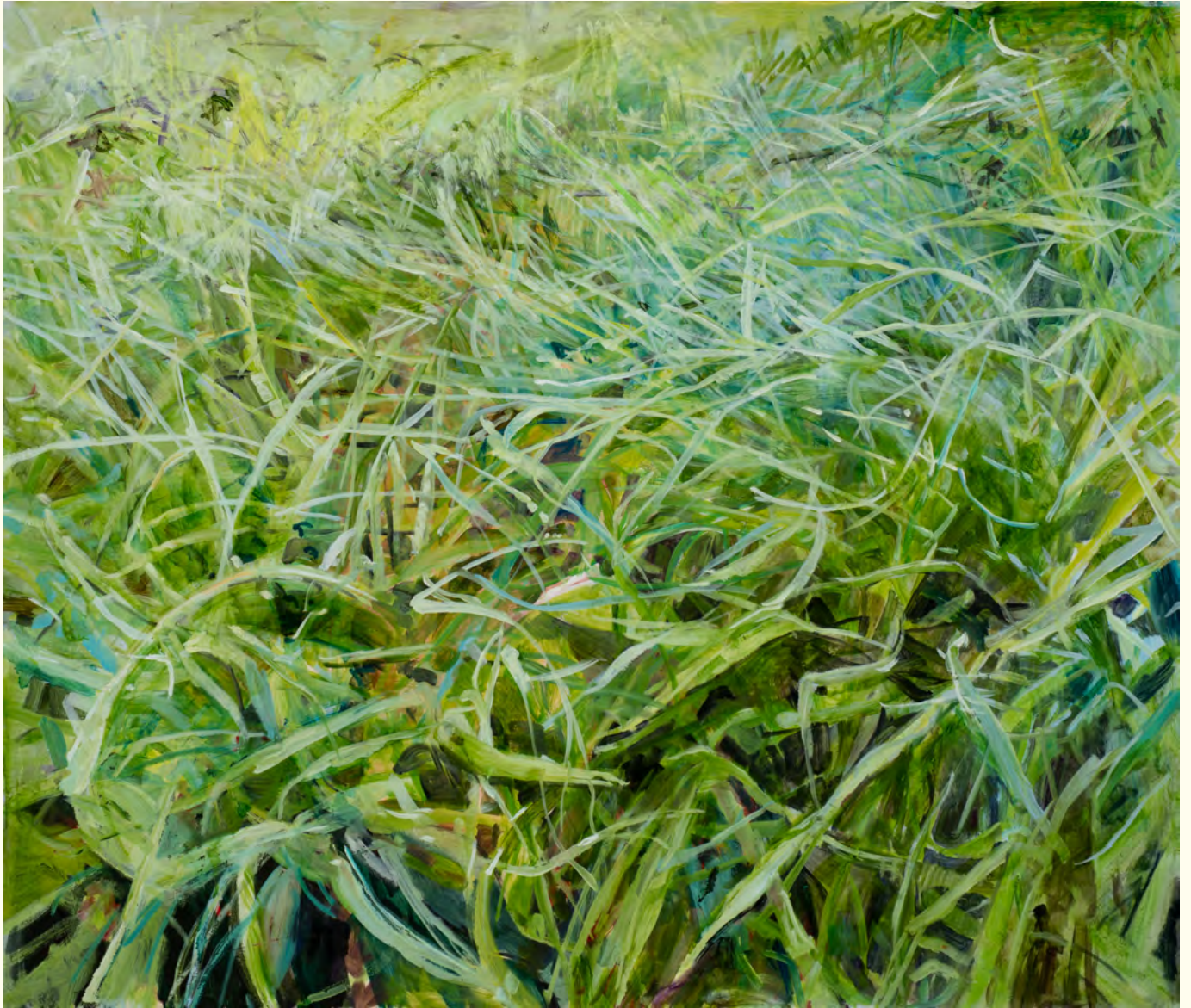
Whenever Liz Sullivan 600 x 700mm oil on board 2024